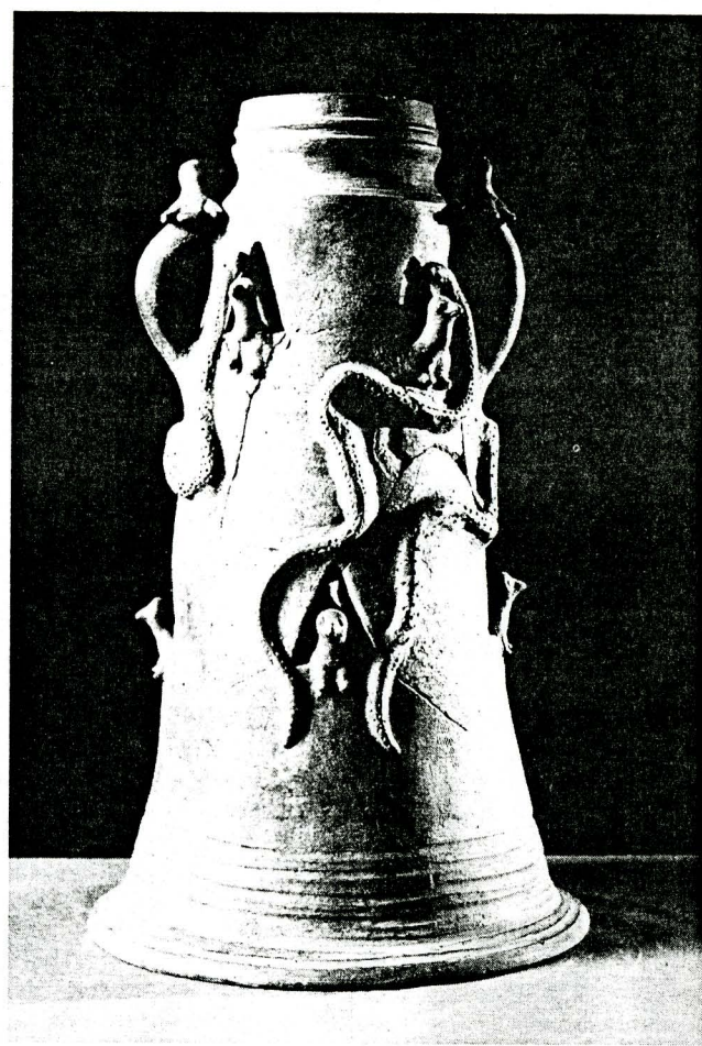
BET.02. Cylindrical stand with snakes and birds from Beth-shan—Level V.

Another gap in settlement followed level IV, although late Iron Age and Persian period tombs were found by Tzori east of the tell. The site was reoccupied in the Hellenistic (363–332 B.C.) and Roman (63 B.C.–A.D. 324) periods—levels III and II. The Hellenistic structures were extensively disturbed by later Roman buildings, in particular by a large temple on the NW side of the tell (initially assigned to the Hellenistic period, but now dated to the 1st century A.D.). The Roman city spread into the valley below the tell, where a colonnaded street, a hippodrome, a villa with mosaic floors, a theater, and an extensive wall circuit (spanning the Wādī Jalud) were uncovered. Roman tombs in the Northern Cemetery produced glass vessels, pottery